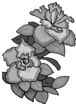
Dianthus grat. 'Firewitch' 2006 Perennial of the Year

Dianthus 'Firewitch' is an outstanding choice for 2006 Perennial of the Year. The long summer display of fragrant bright magenta pink flowers, blue-silver foliage, and versatility in the garden makes this one a winner.